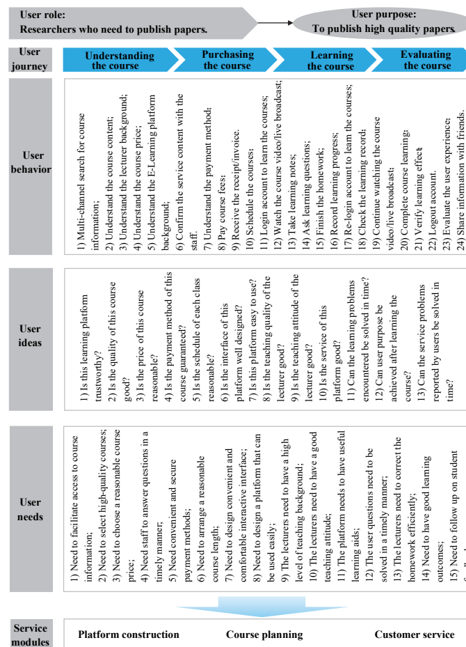
Figure 2 Customer Journey Map of E-Learning Platform